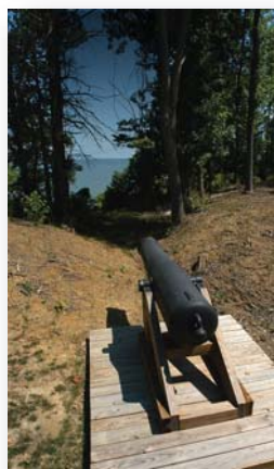
Reproduction canons overlooking the James River at Historic Fort Huger