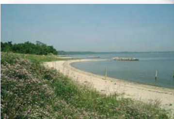
The natural beauty of Fort Boykin Historic Park

17130 Monument Circle, Isle of Wight, 757-365-9771