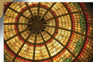
Stained glass dome at the Isle of Wight Museum