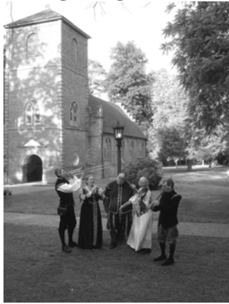
Locrian Consort performs for the 54th Annual Pilgrimage